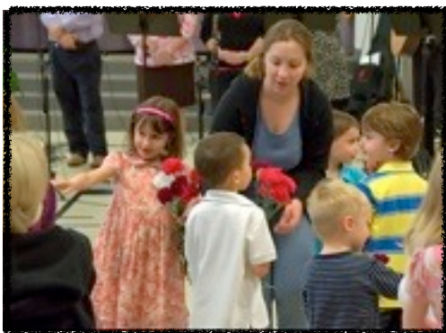
Mother's Day 5/8/11