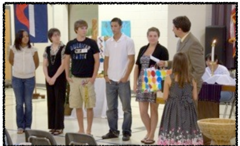
Graduation Sunday 6/5/11