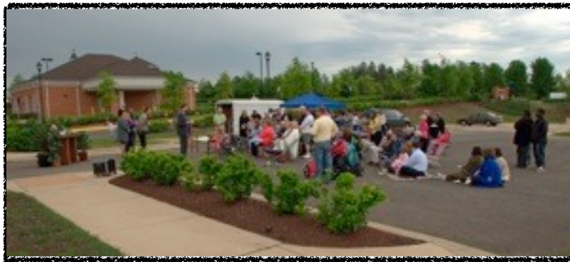
Church Service in Parking Lot 5/1/11