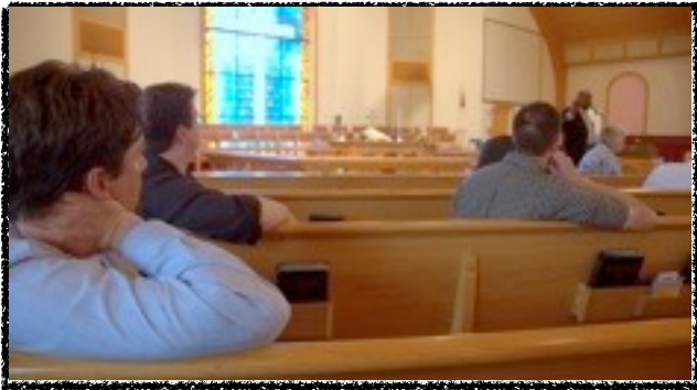
Town Hall Meeting 5/22/11